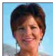
Yvette Herrell (R) Candidate for U.S. Representative, Dist. 2

5. Republican House Leadership has created the most dysfunctional Congress. The resulting chaos and disarray, including the unprecedented removal of a Speaker, have hindered progress and left many Americans underserved. New Mexico deserves better. I focus on serving the people by addressing the everyday challenges working families face. From the affordability of groceries to the availability of housing, my commitment is to deliver tangible improvements that positively impact our constituents. To restore functionality to Congress, we must reclaim the majority and elect leaders who prioritize results over chaos. It's time to shift from policies that divide and inflame toward those that create a brighter, more equitable future for all Americans.