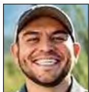
Gabriel Vasquez (D) Candidate for U.S. Representative, Dist. 2

1. Extreme Republicans prioritize petty politics over common-sense solutions. Actual governance is the biggest issue facing Congress, impacting women's reproductive rights, inflation, affordable housing, immigration and border security, which are top issues for Congress to solve. My constituents are concerned about the economy, access to clean water, affordable broadband and quality healthcare, including women's reproductive healthcare. Unlike my opponent, who sponsored legislation to restrict abortion access, I firmly believe in a woman's right to choose. I am tired of this district being left behind because Republican Leadership continues to put politics over people. We must keep this district blue and take back control of the House in 2024.