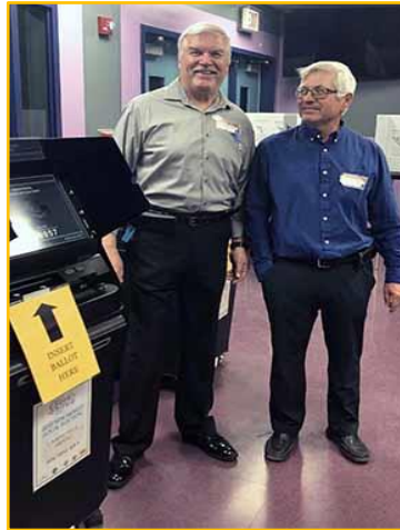
Election workers at the Camino Real Mid School voting location in the Nov. 2023 election.

These trainings are open to the public. Those wishing to apply to become an election official can sign up by visiting: https://www.donaanacountyelections.com/election-officials/