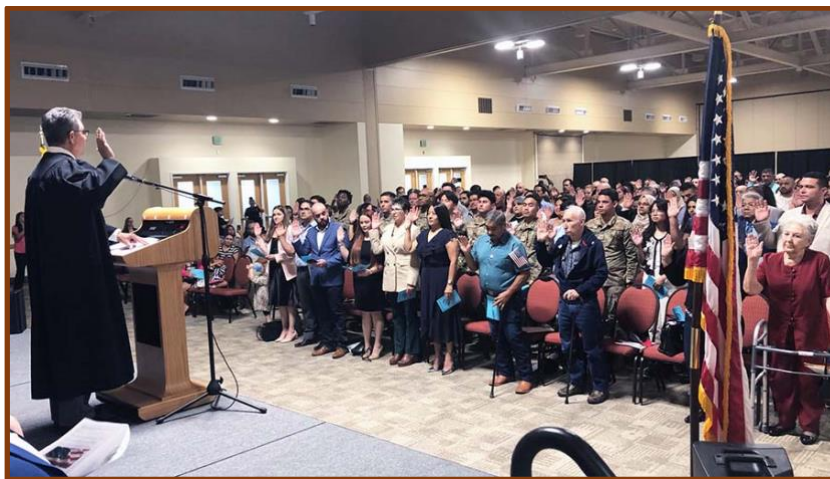
Residents from countries all over the globe become naturalized citizens after studying and taking a test. US District Court Judges administer the oaths that the new citizens repeat.